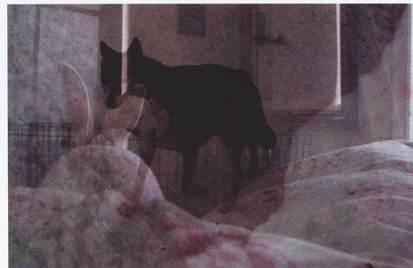
Michel Auder, Narcolepsy , 2010, stills from a color video, 22 minutes 48 seconds.

York at Newman Popiashvili (Auder used some of the same footage in his installation Dinner Is Served at Krabbesholm Højskole, Skive, Denmark, earlier this year), the video revolves figuratively if not quite literally around the image of a young woman, fast asleep, sitting upright on what might be a restaurant banquette. The piece is made up of multiple layers of superimposed imagery and twelve layered tracks of sound. The low-res picture recalls Super 8 film, but the colors are softer without appearing washed-out. The texture of the image, particularly in the close-ups of the woman's face, evokes the cracked, varnished surfaces of old-master paintings. Superimposition was used extensively by avant-garde filmmakers in the '50s and '60s, sometimes to economize (it was cheaper to roll back the film in the camera and record two or three times on a single