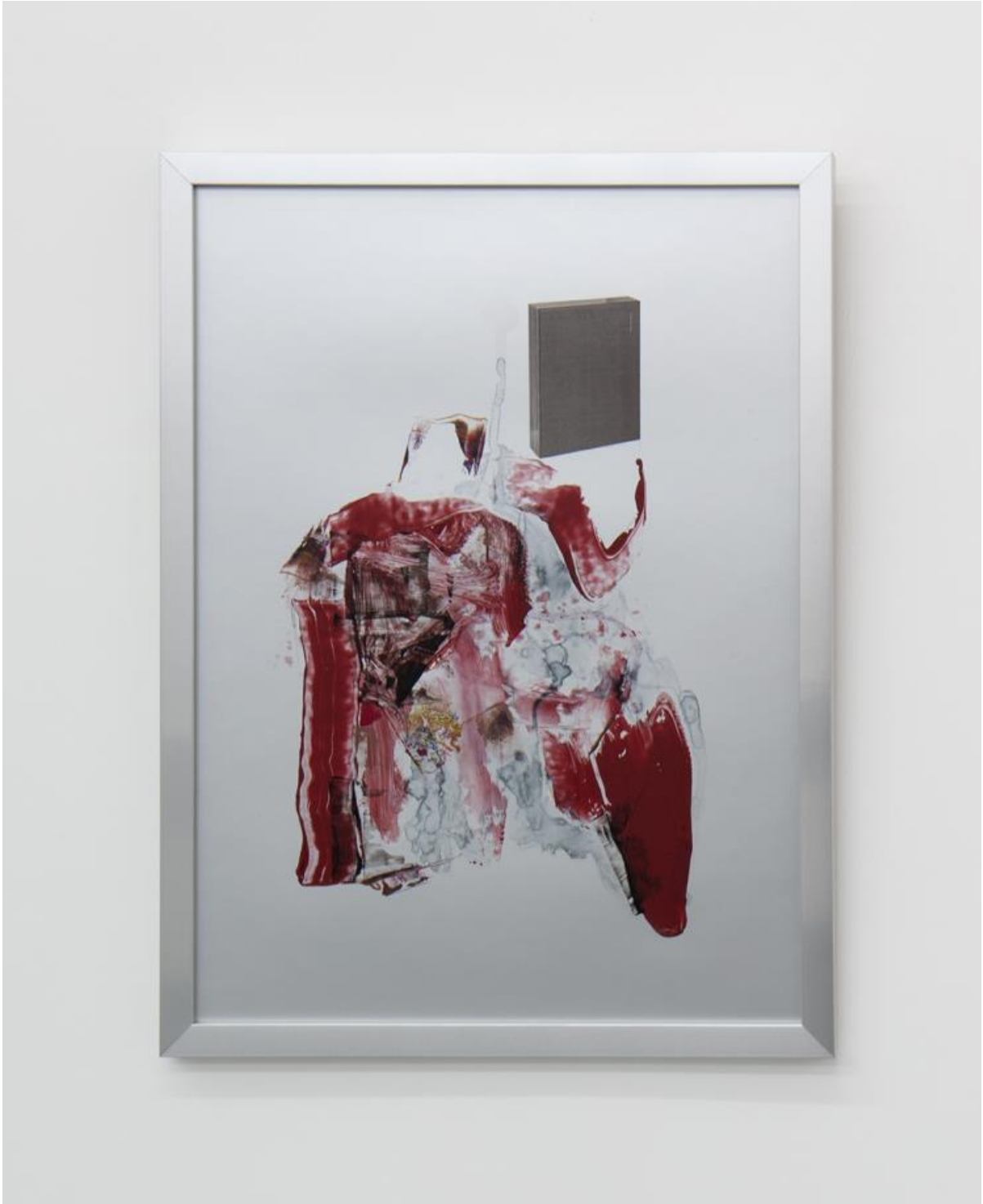
Seb Patane, Eleganza II , 2016 Acrylic, ballpoint pen, ink, enamel and collage on chromalux card cm. 42 x 30