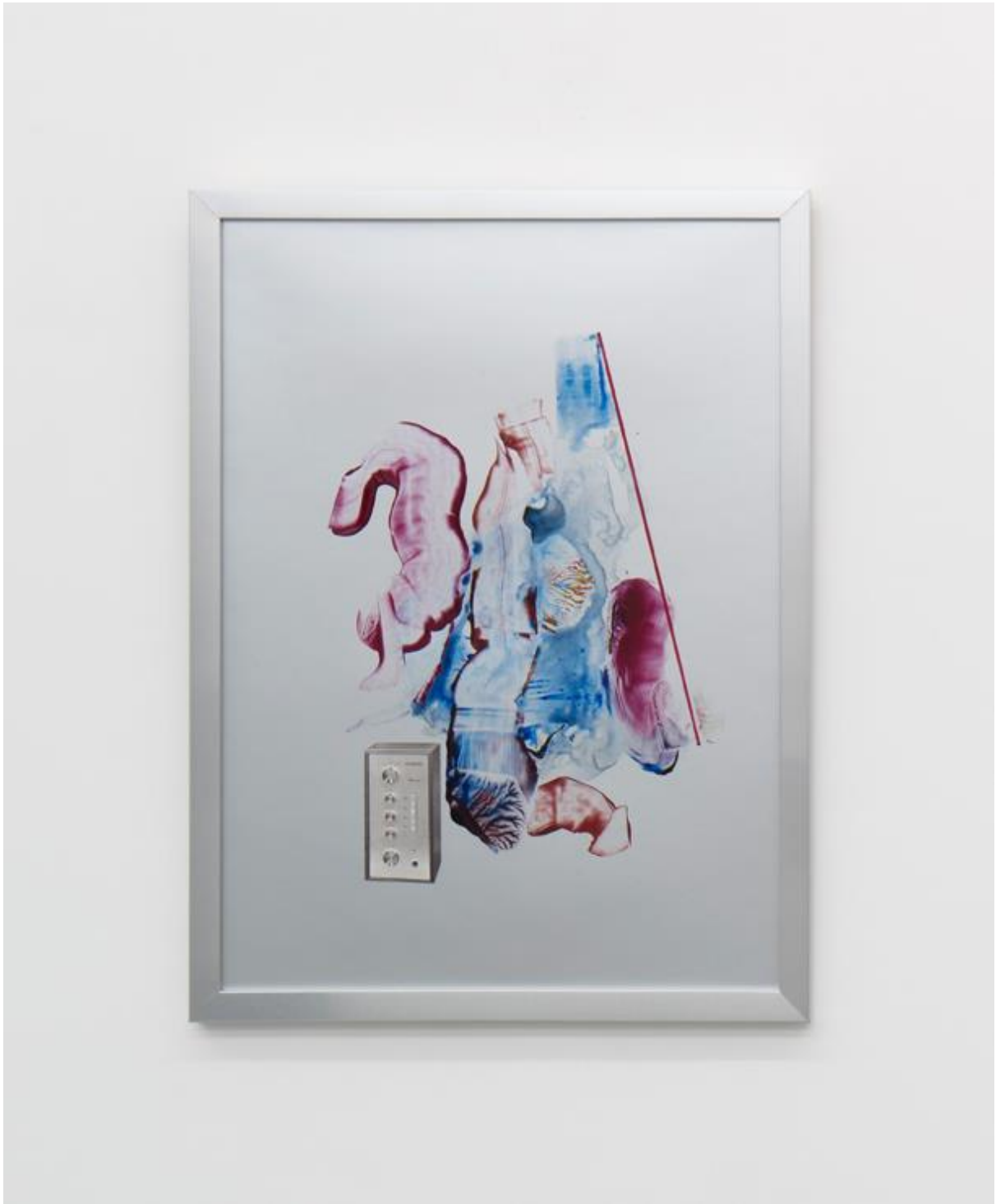
Seb Patane, Twin Axiette , 2016 Acrylic, ballpoint pen, ink, enamel and collage on chromalux card cm. 42 x 30