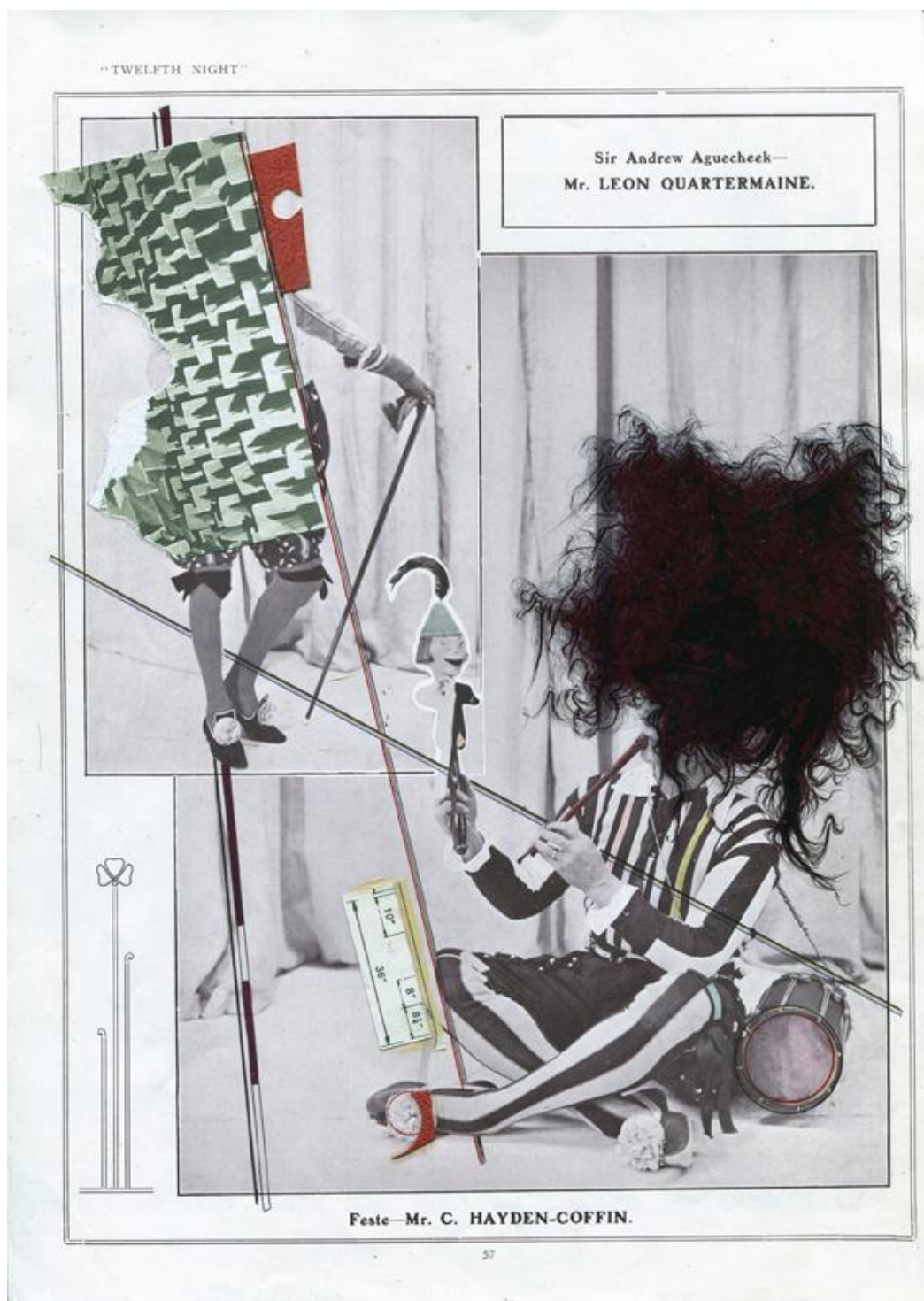
Seb Patane, Feste , 2017 Ballpoint pen, collage, pencil and enamel on printed paper cm.29 x 20