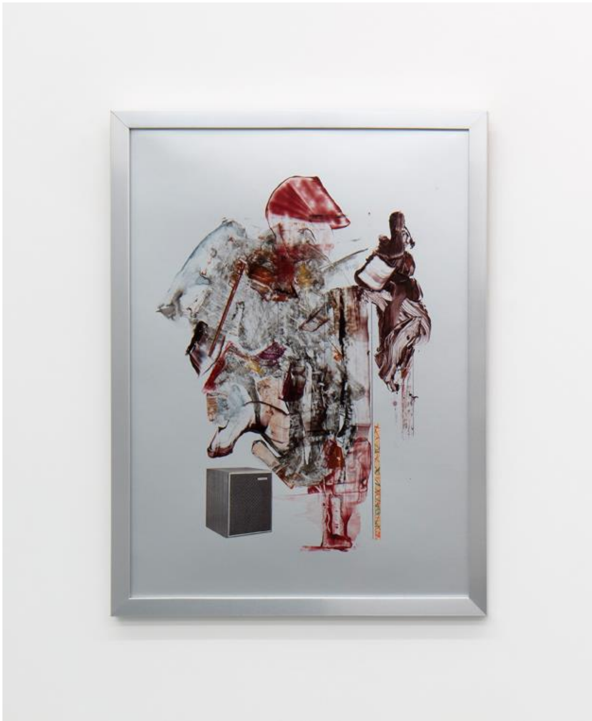
Seb Patane, Axiom 80 , 2016 Acrylic, ballpoint pen, ink, enamel and collage on chromalux card cm. 42 x 30