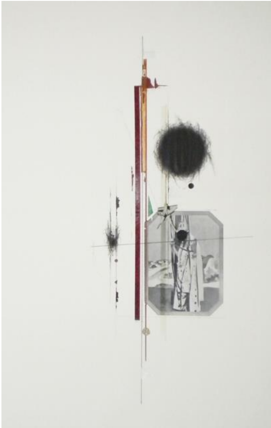
Seb Patane, Maypole , 2014 Pen, collage, acrylic, enamel cm. 100 x 70