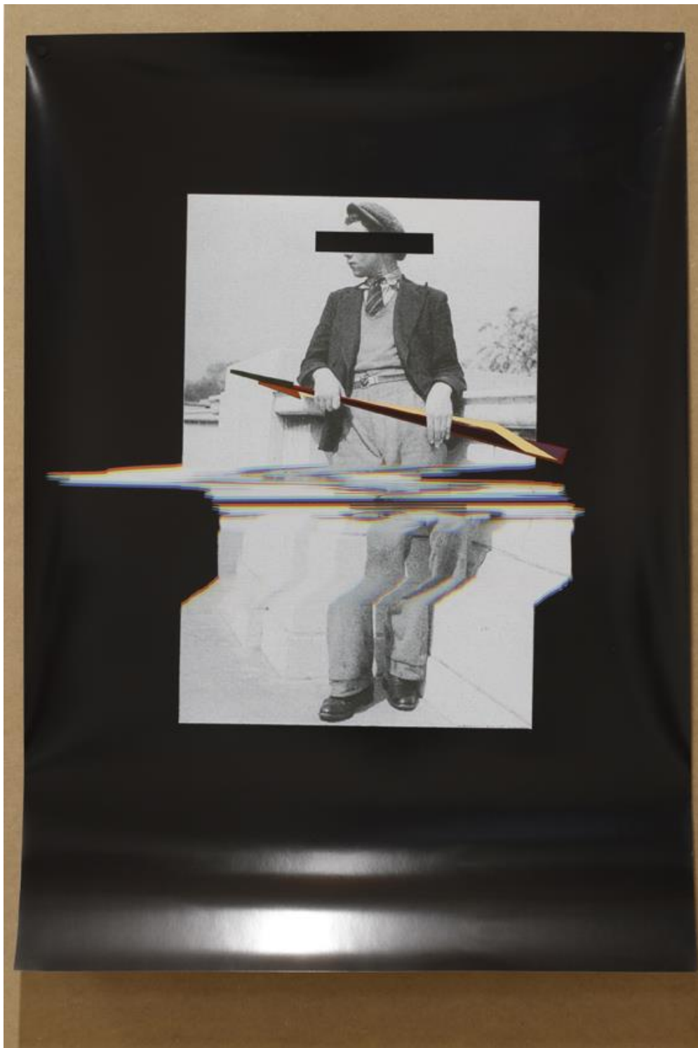
Seb Patane, John , 2017 UV print, acrylic and collage on black chromalux card cm.100 x 70