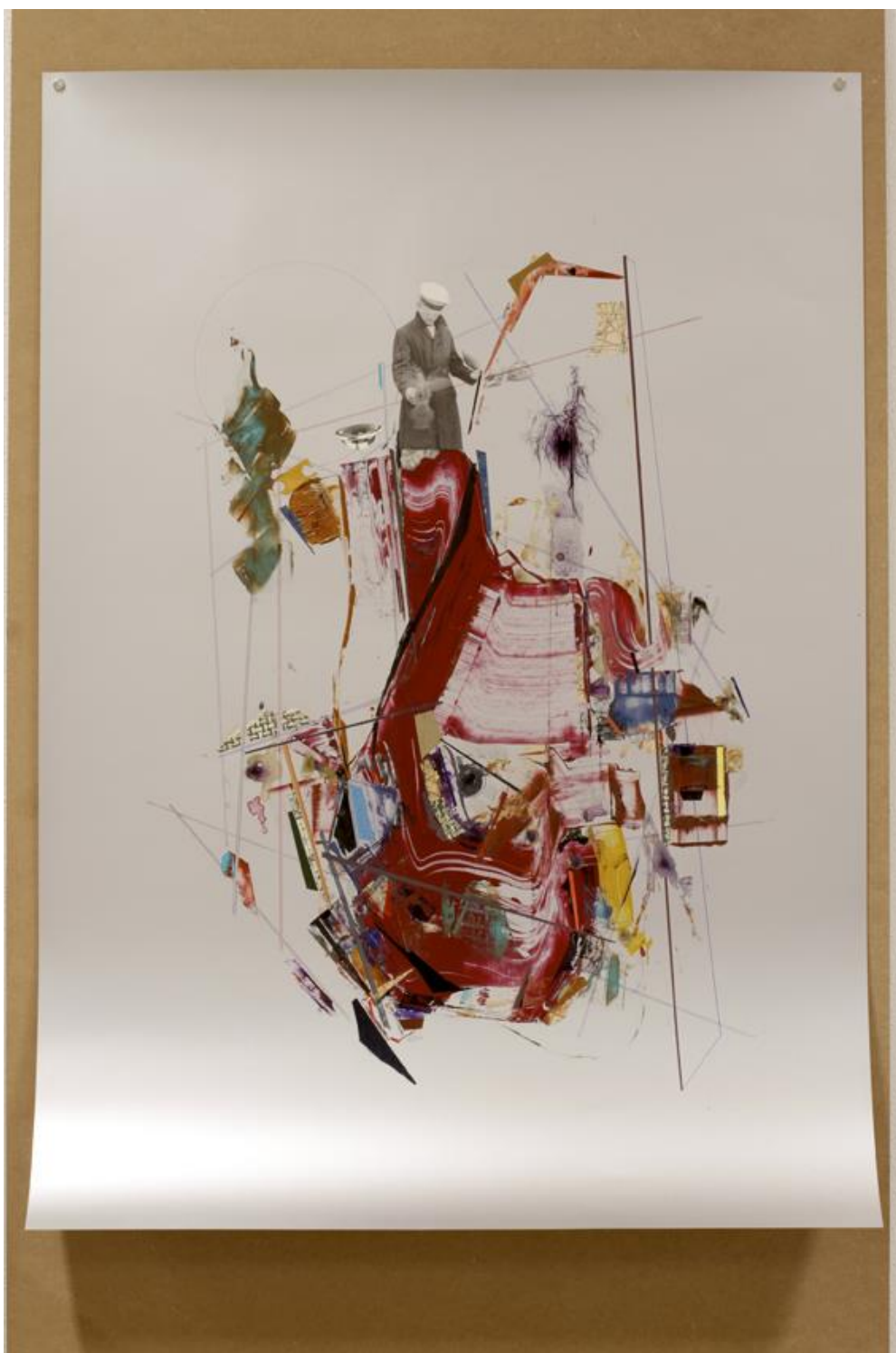
Seb Patane, Jack , 2017 Ballpoint pen, acrylic, collage and enamel on silver chromalux card cm.100 x 70