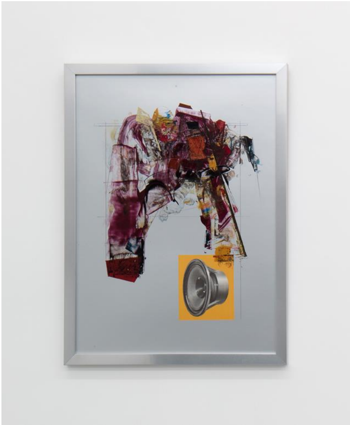
Seb Patane, MagnumK , 2016 Acrylic, ballpoint pen, ink, enamel and collage on chromalux card cm. 42 x 30