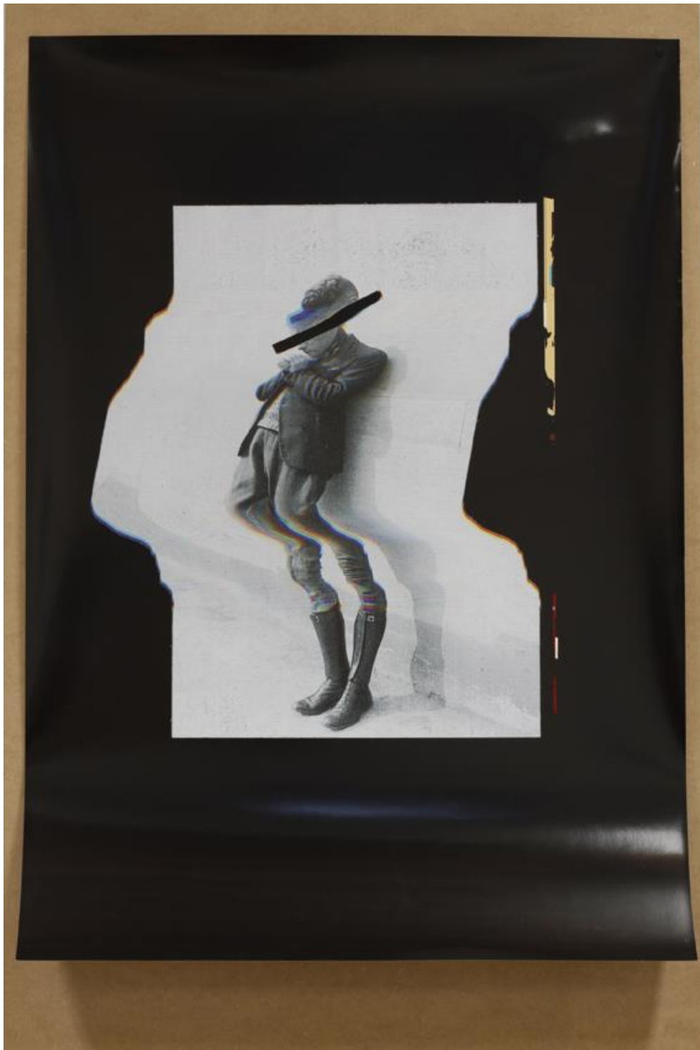
Seb Patane, William , 2017 UV print, acrylic and ballpoint on black chromalux card cm.100 x 70