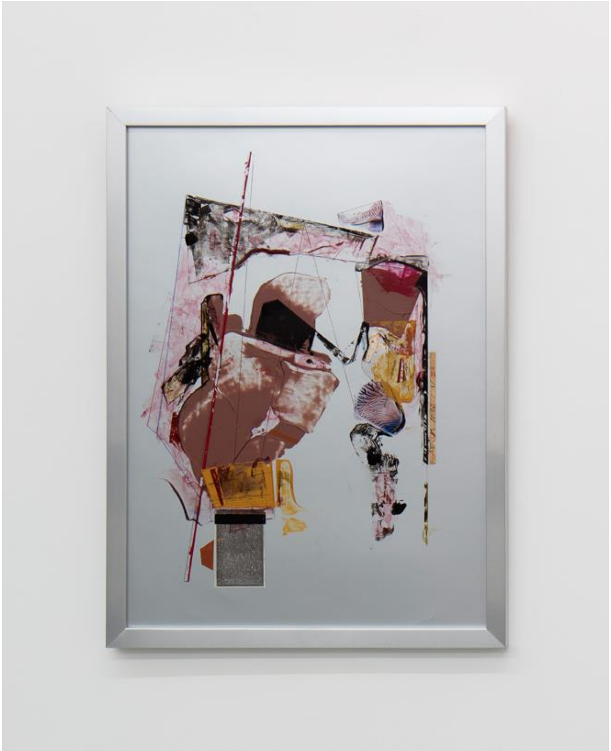
Seb Patane, Audium 81 , 2016 Acrylic, ballpoint pen, ink, enamel and collage on chromalux card cm. 42 x 30