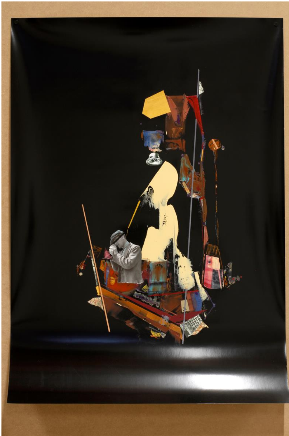
Seb Patane, Frank , 2017 Ballpoint pen, acrylic and collage on black chromalux card cm.100 x 70