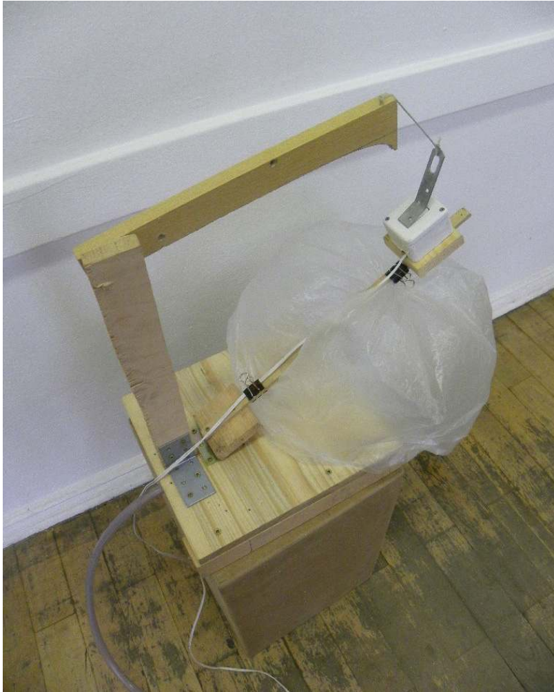
Lorenzo Scotto di Luzio, Untitled , 2010, plastic bag, wood, electric pump, string, cm. 32x32x85