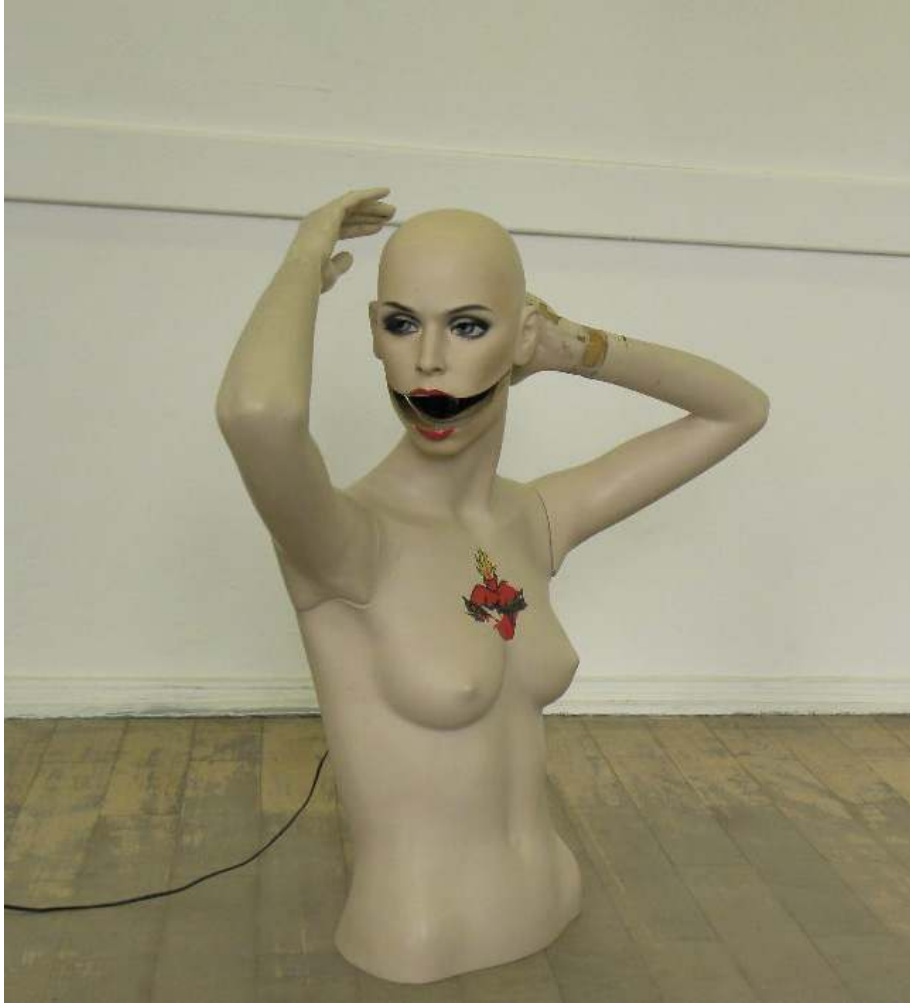
Lorenzo Scotti di Luzio, Untitled , 2010, dummy, electric engine, cm. 40x40x80, courtesy galleria Fonti, Napoli