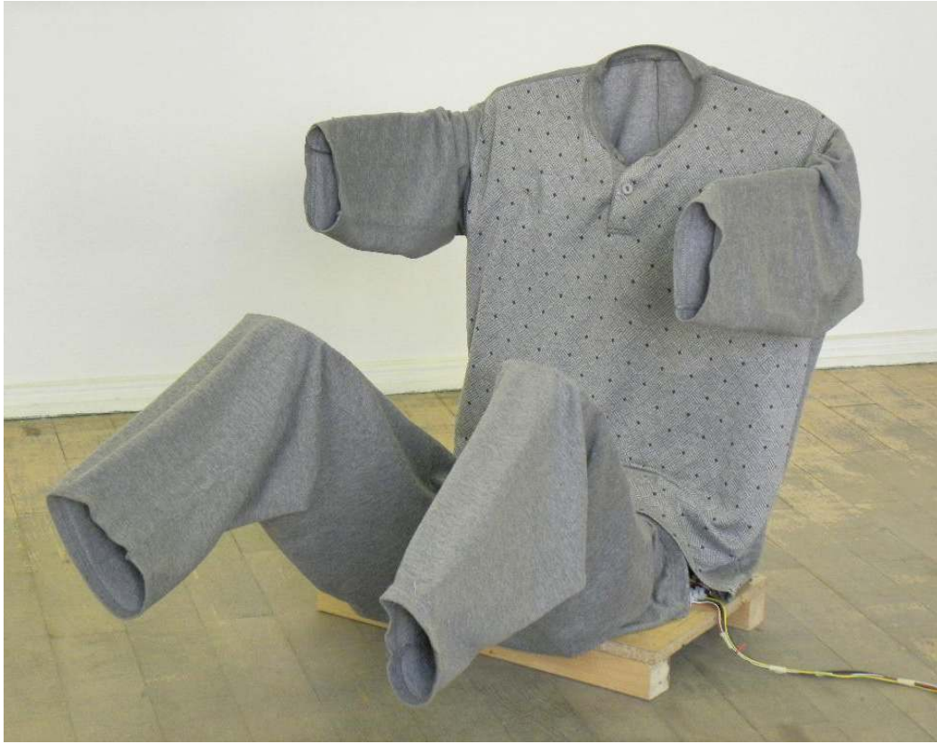
Lorenzo Scotto di Luzio, Untitled , 2010, pyjamas, wood, electric engine, cm. 170x60x10