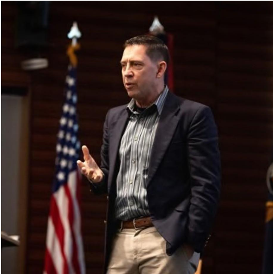
Eric Wesley New Self-Portrait #3 , 2020 oil on canvas 90 x 110 cm