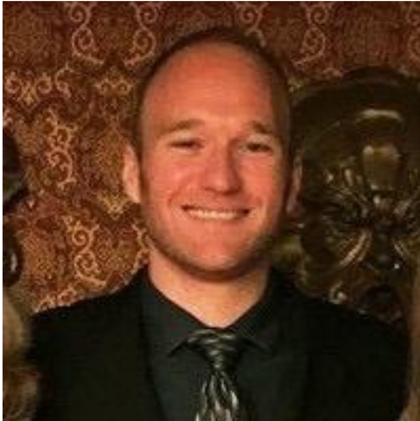
Eric Wesley New Self-Portrait #6 , 2020 oil on canvas 45 x 60 cm