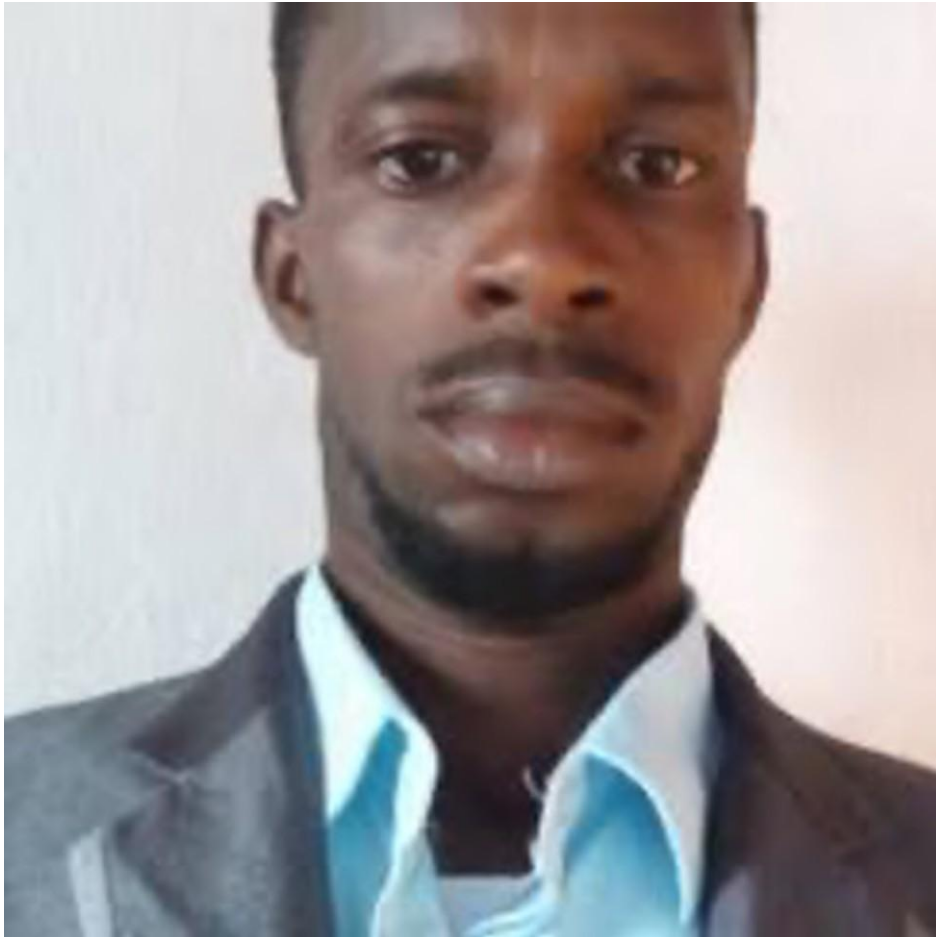
Eric Wesley New Self-Portrait #4 , 2020 oil on canvas 50 x 70 cm