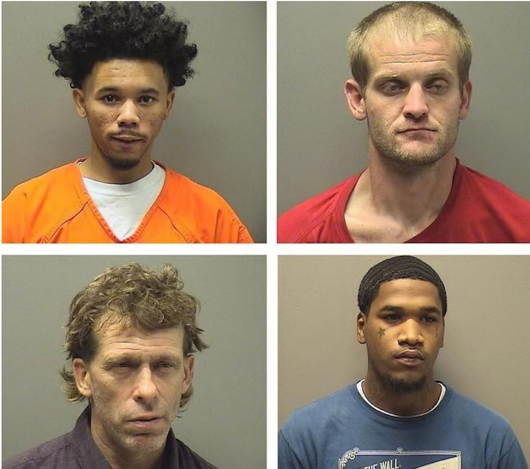
Eric Wesley New Criminals , 2020 oil on canvas 180 x 180 cm