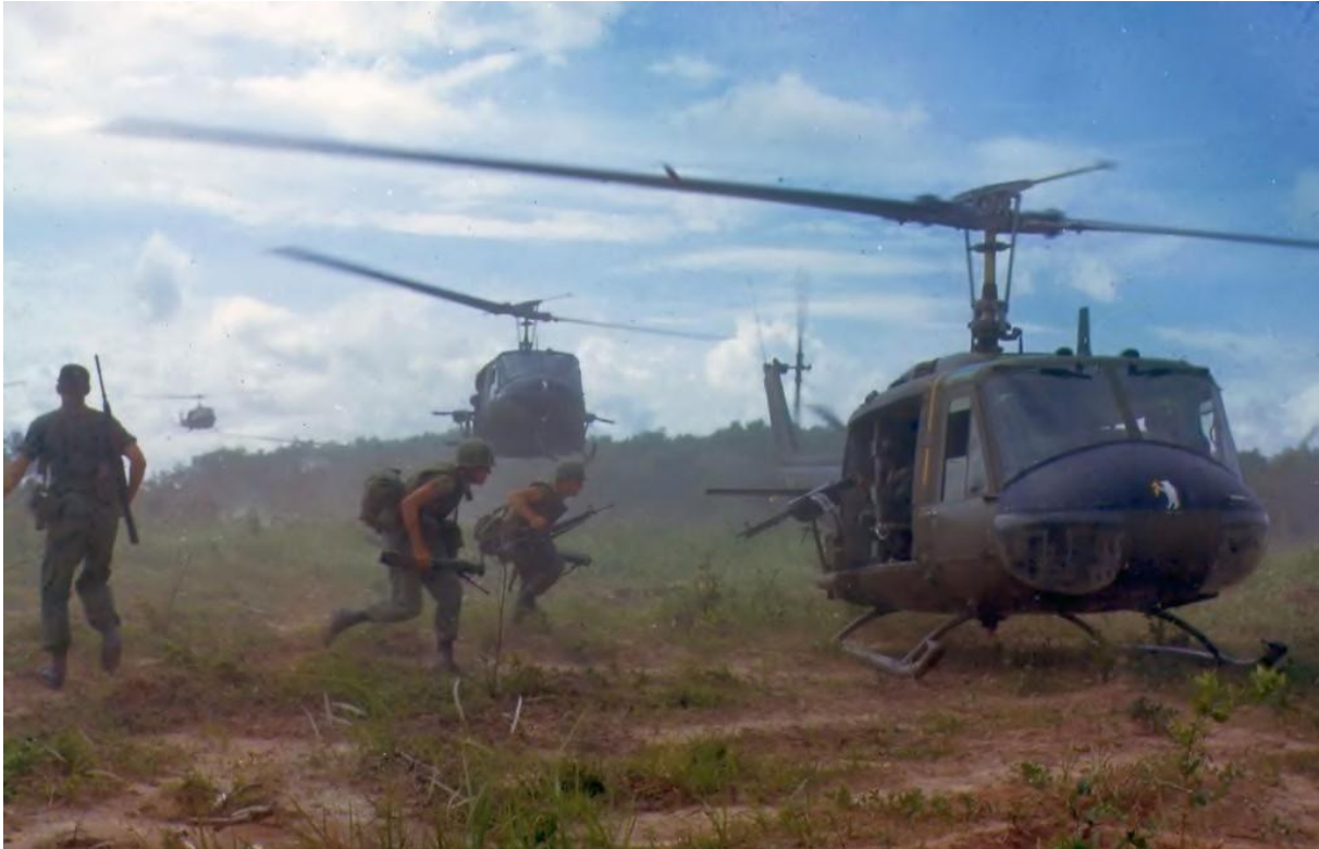
Eric Wesley New Self-Portrait #7 , 2020 oil on canvas 80 x 95 cm