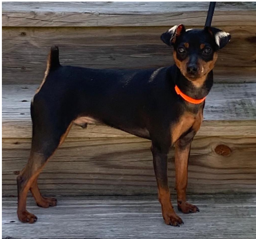
Eric Wesley Dog , 2020 oil on canvas 60 x 90 cm