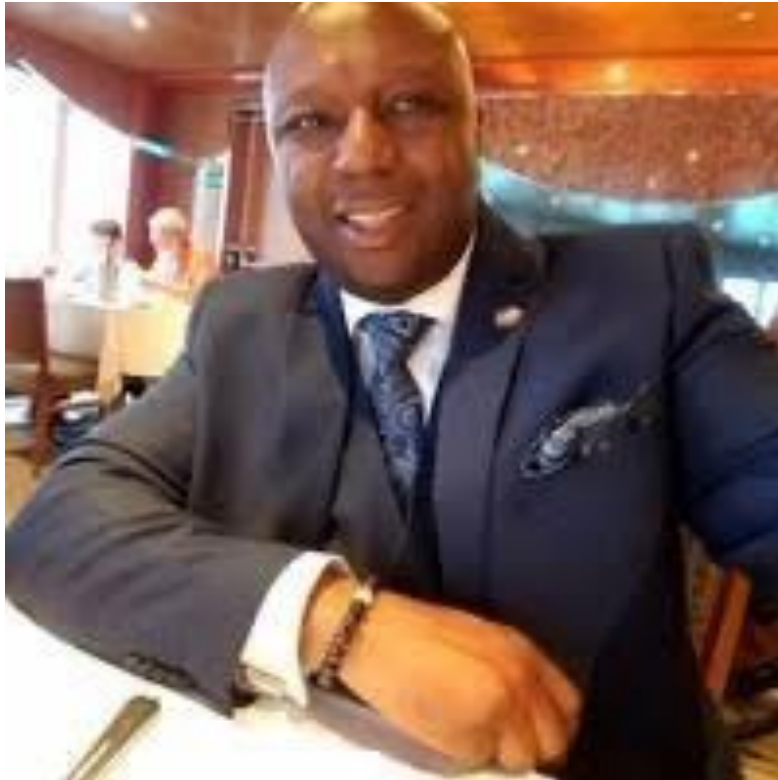
Eric Wesley New Self-Portrait #9, 2020 oil on canvas 45 x 60 cm